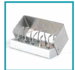
Kit with 6 insert tips (5 sharp, 1 smoothing)