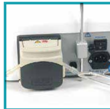
Pump with easy insertion of the irrigation set