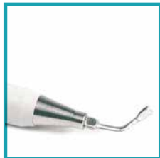
High power handpiece with internal spray