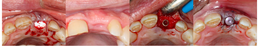
Socket Preservation for Implant